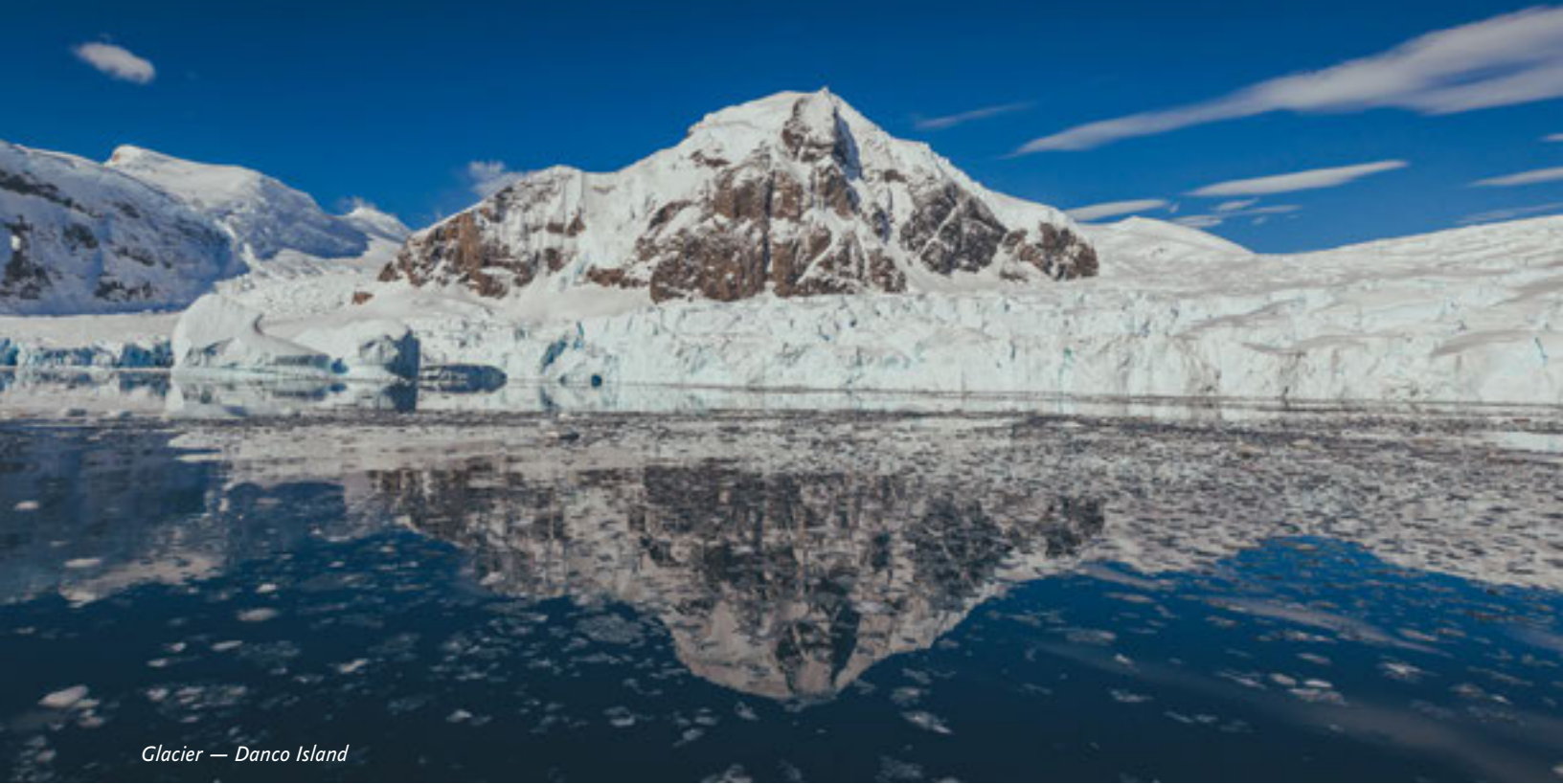
Glacier — Danco Island

Both the volcanic islands already mentioned are well worth visiting. Penguin Island offers Adélie and chinstrap penguin rookeries and abundant giant petrels, as well as a hike up the volcanic cone for a spectacular view. At Deception Island, there is a very large chinstrap penguin colony at Baily Head, on the outside of the island. This is a wonderful place, though sometimes difficult to land unless the sea conditions are favourable. Entering the vast flooded caldera through Neptunes Bellows, one sees the remains of a large Norwegian whaling station in Whalers Bay, and the remains of Chilean and British stations which were destroyed during eruptions in 1969. At Pendulum Cove, it is sometimes possible, when the tide is right, to swim in volcanically heated waters near the black sand lava beach. Many visitors enjoy this unusual experience.