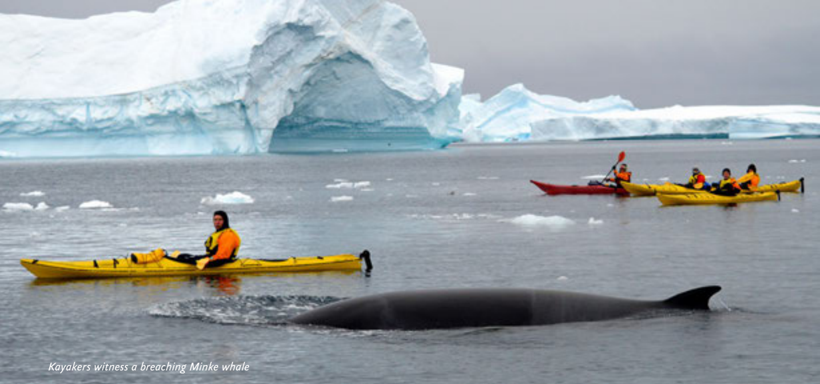
Kayakers witness a breaching Minke whale