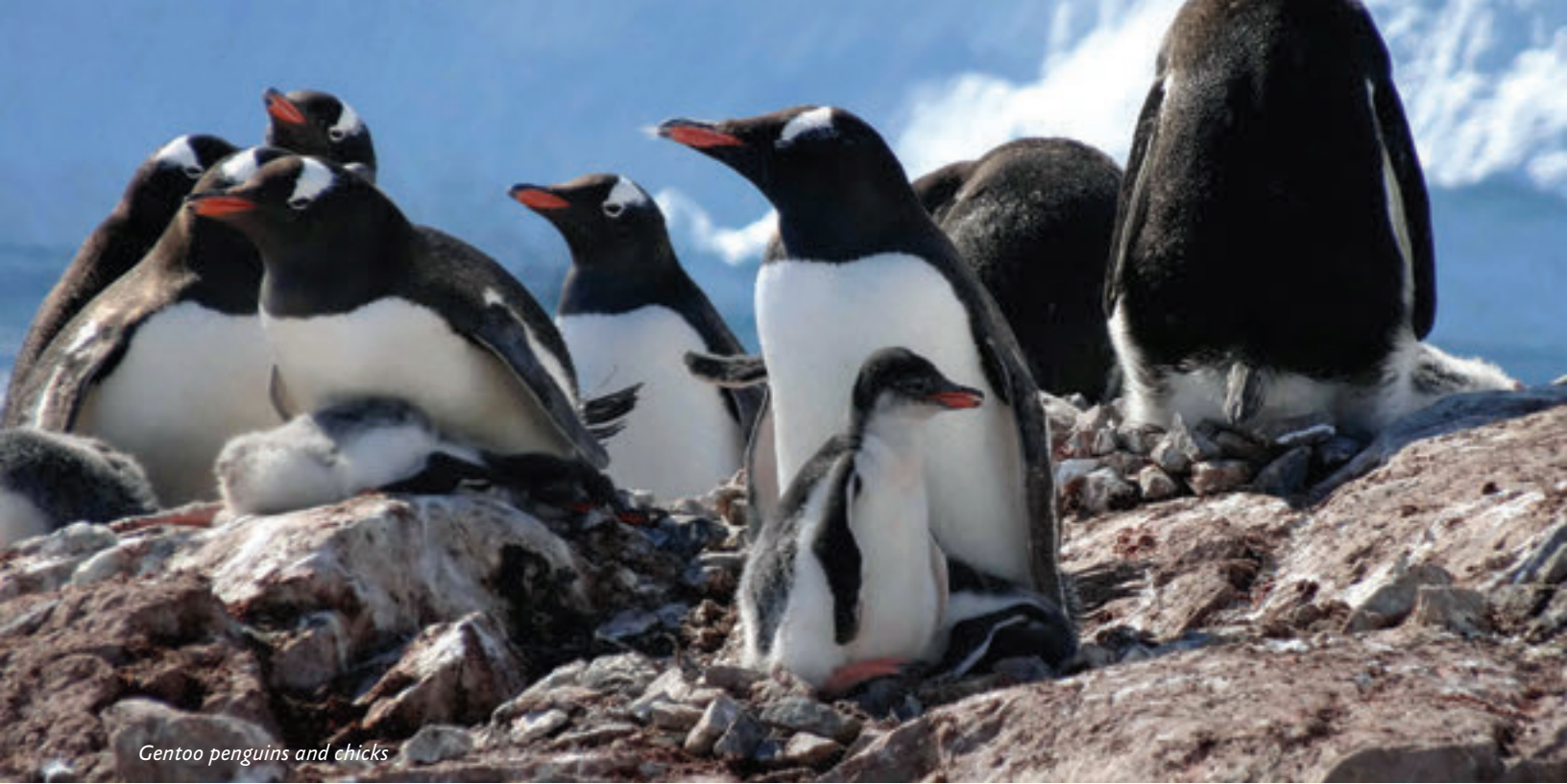
Gentoo penguins and chicks

wind. Their nests usually consist of mounds built of mud, grasses, moss, and excrement; they lay just one egg.