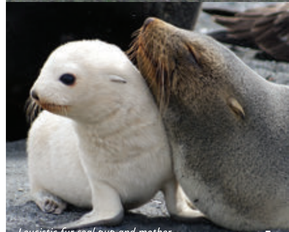
Leucistic fur seal pup and mother