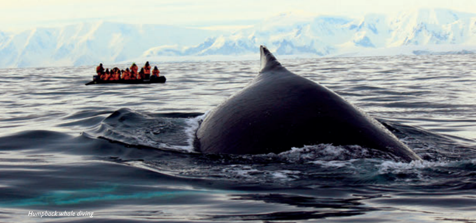
Humpback whale diving

which produce a high and distinctive V-shaped double spout. The tail of this species, which is broad with very pointed tips and a deep notch, is usually raised above the surface when the animal dives.