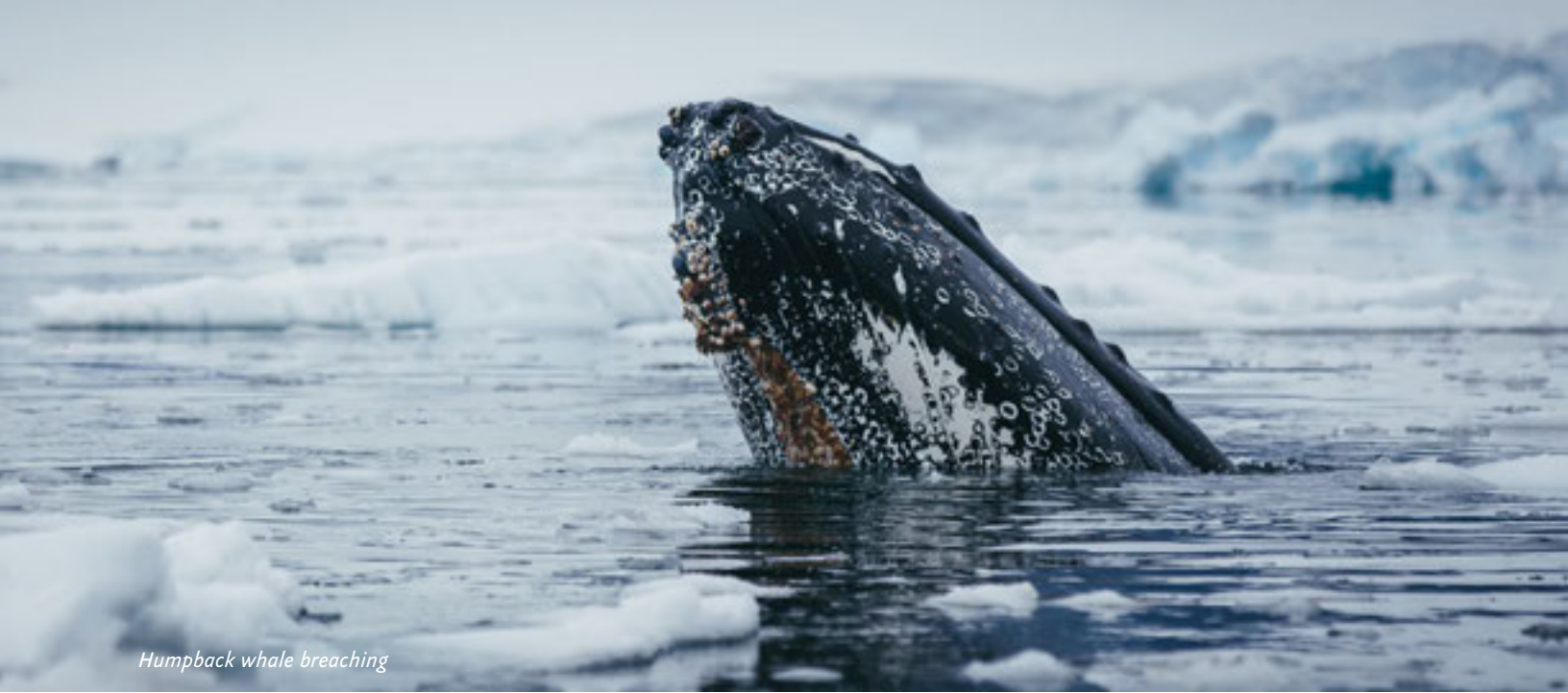
Humpback whale breaching