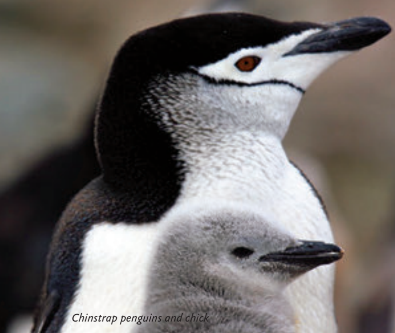
Chinstrap penguins and chick