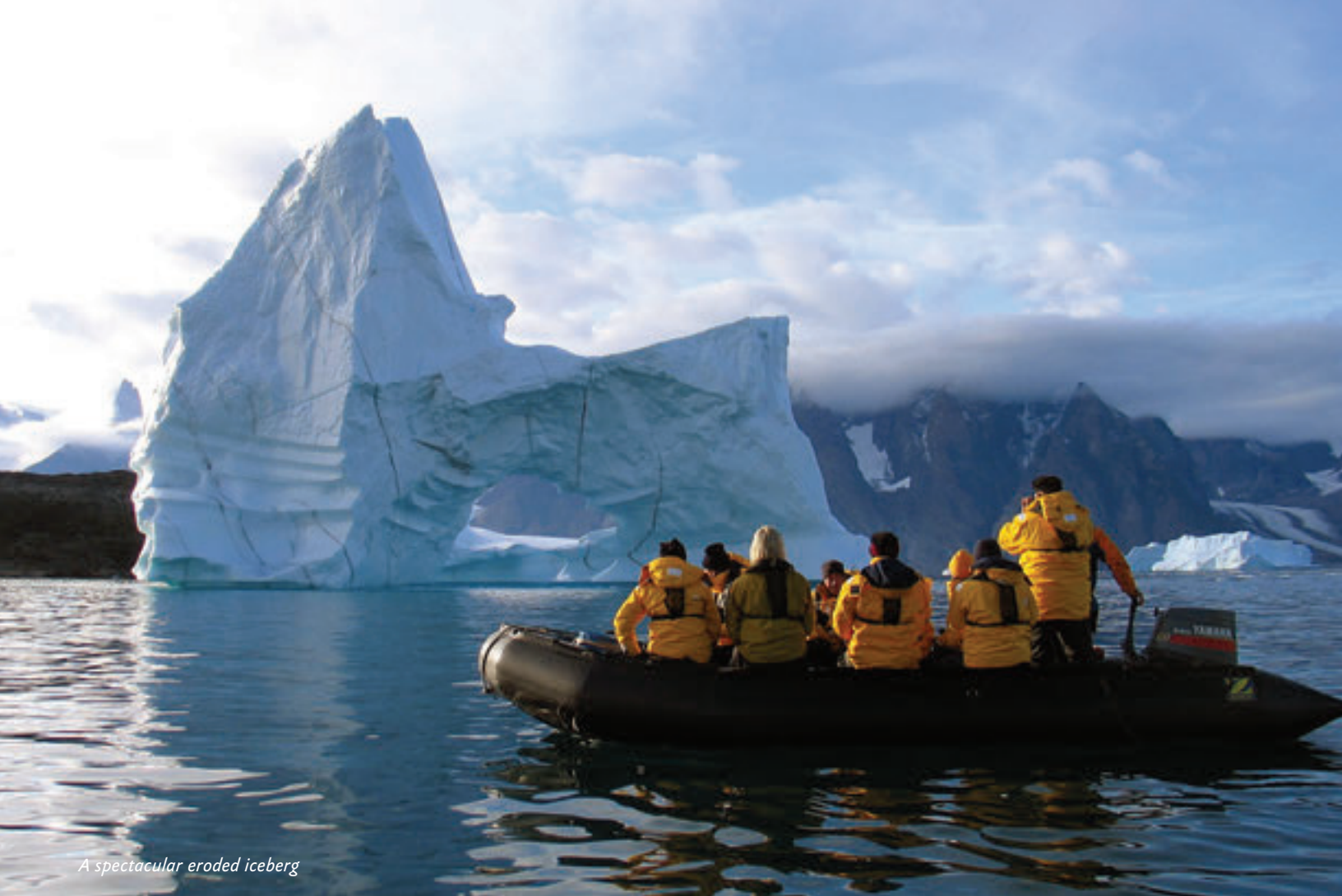
A spectacular eroded iceberg

Effect. This trapped heat is necessary to keep the Earth's climate warm enough for life to exist. But there must be a balance to ensure the Earth neither cools nor warms too much.