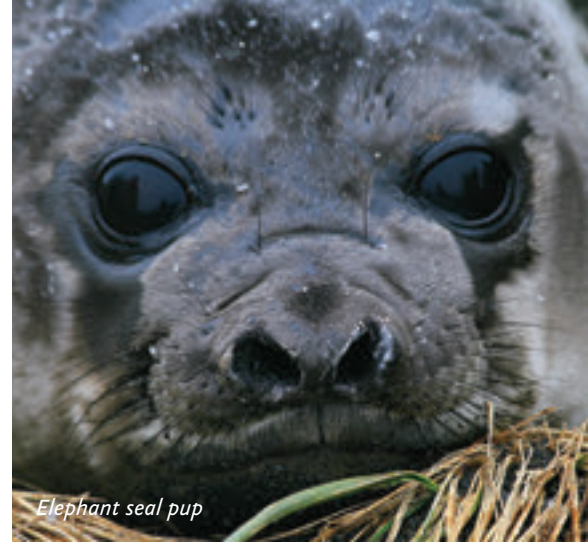
Elephant seal pup