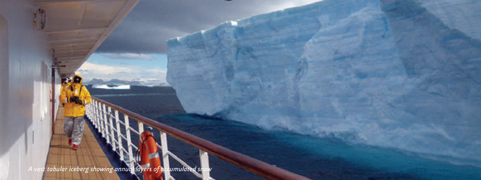
A vast tabular iceberg showing annual layers of accumulated snow