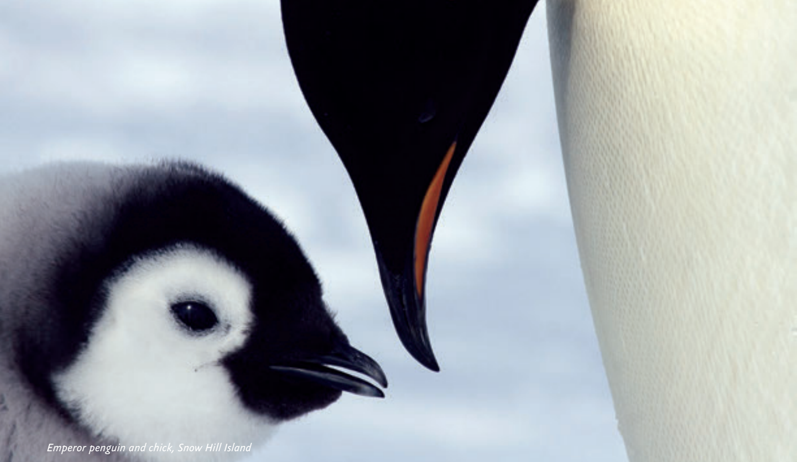
Emperor penguin and chick, Snow Hill Island

governor. Soon after its discovery the fur seals were being over exploited for their skins. Elephant seals and later penguins were killed for their oil. The seals and penguins were slaughtered unremittingly over the years until commercial exploitation finally ended in 1919. During this period, one species of fur seal became extinct, along with an endemic rail and a parakeet. Various birds and mammals were introduced, either deliberately or accidentally, though these are gradually being eradicated and controlled. An eradication programme against the wild cats was successfully completed by 1998 but then rodent numbers increased drastically with rabbits destroying large areas of vegetation. Rodent eradication began in 2008 to eliminate rats, mice, and rabbits. Early reports have the good news of its success, but a few more years will be necessary before this can be confirmed.