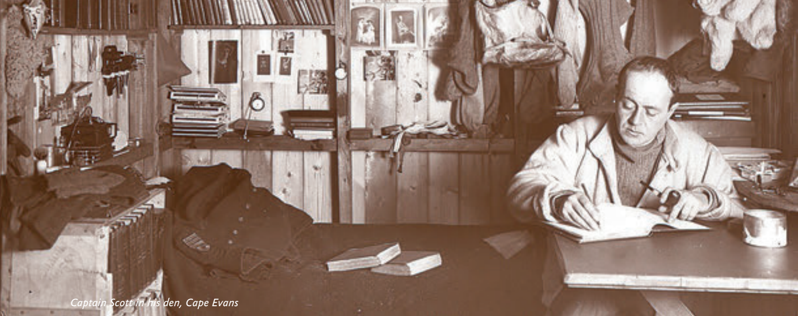
Captain Scott in his den, Cape Evans

the development of science throughout the world. It included a cooperative and coordinated concentrated research program which was undertaken by 12 countries some with existing stations in Antarctic regions and others that established observatories for the purpose. In total 54 stations were open for the 1957 winter, which remains the largest number in the Antarctic (19 of them remained continuously open for the next 50 years).