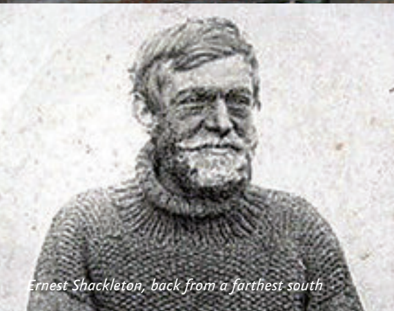
Ernest Shackleton, back from a farthest south