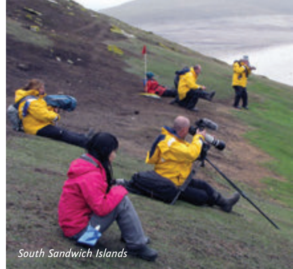
South Sandwich Islands