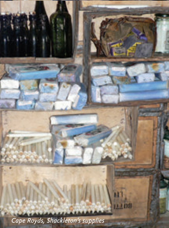
Cape Royds, Shackleton's supplies