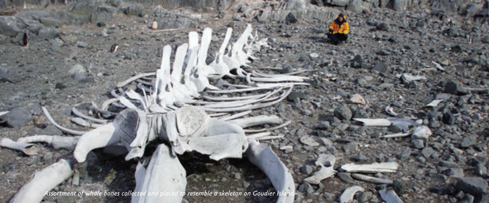
Assortment of whale bones collected and placed to resemble a skeleton on Goudier Island.