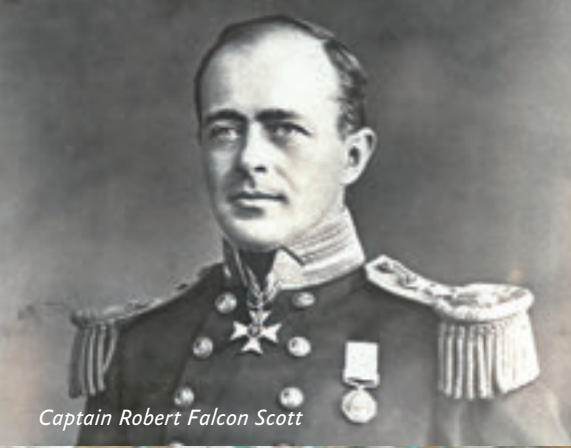
Captain Robert Falcon Scott

first crossing of the Antarctic Circle on 17 January 1773, reached a farthest south at 71.17°S at 106.90°W (north of Thurston Island) on 30 January 1774, and the earliest definite landing in Antarctic regions on 17 January 1775, on South Georgia. Cook was unlucky in one respect, the two places where he sailed far south were where the coast of Antarctica is also far south, at many other positions he might have discovered the continent.