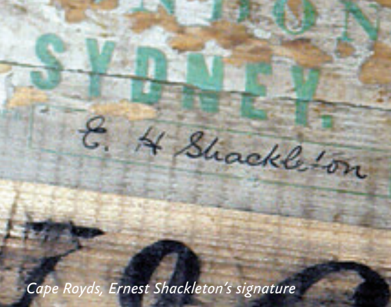
Cape Royds, Ernest Shackleton's signature

Edward Bransfield, of Britain's Royal Navy, was sent to examine the South Shetland Islands in 1819; he sighted and charted land most probably the Danco coast of the Antarctic Peninsula on 30 January 1820. Later in the year, Nathaniel Palmer, a young sealing captain from Stonington, Connecticut, sailed from the South Shetlands aboard the 47-foot sloop Hero , and on 16 November, 1820 sighted what was probably the coast of the Antarctic Peninsula, from a distance of about three miles.